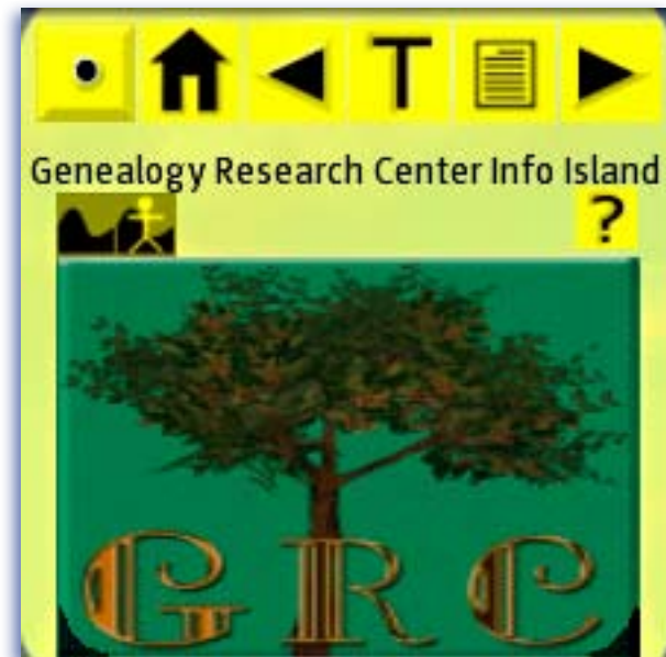
Figure 2. Genealogy Tour HUD helps you navigate through Second Life.